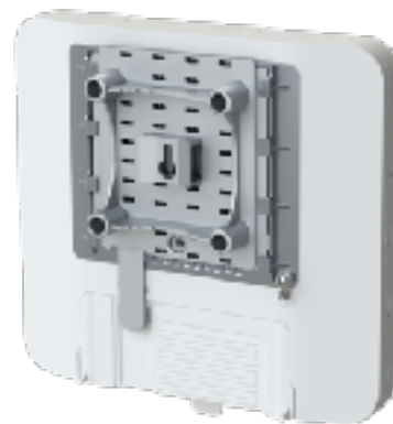
Secure wall/pole mount