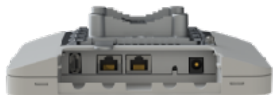
I/O region w/ direct fiber connect